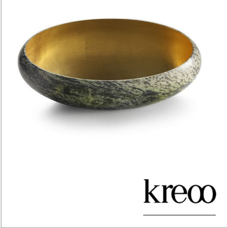
SHOWN IN BURNISHED VERO IRLANDA & GOLD LEAF INTERIOR